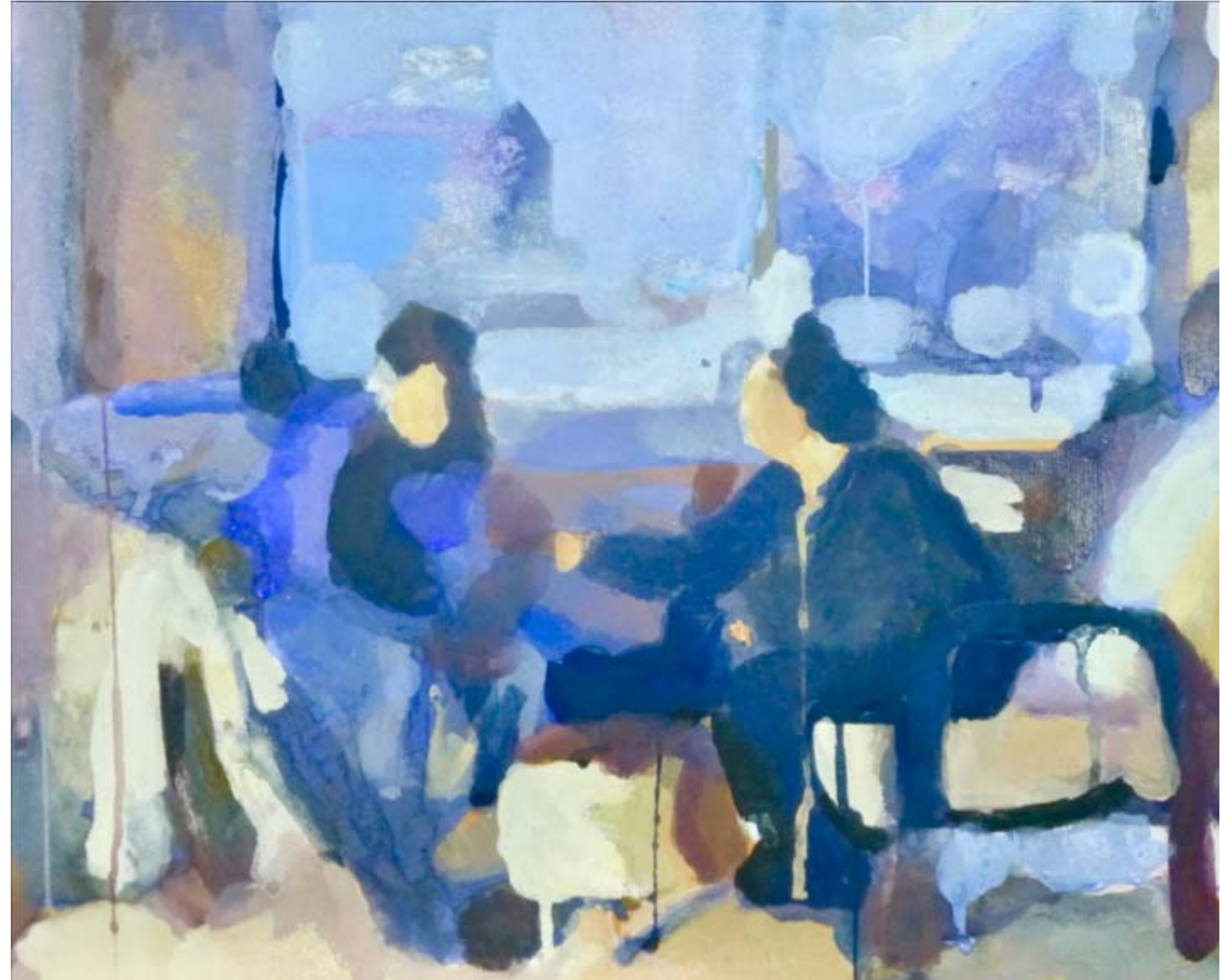
SEE MEMORY Still

VIVIANE: So relating this to memory, when people come in to tell you their story, they're telling you the memory of their life, and you talked about different kinds of memory, so can you talk about how explicit memory comes up and its relationship to storytelling and then what about unconscious memory? Can you make unconscious memory conscious?