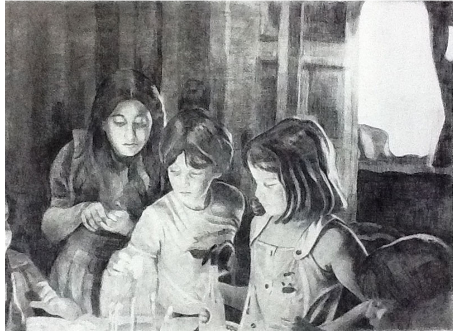
Drawing: Birthday . Borrowed Memory series

When I began making SEE MEMORY, I was trying to come to terms with my unknowable past. During the process, I discovered that the not knowing can lead to invention and creativity: My initial attempts at stop motion were total failures. I threw away a year of work - over 20,000 stop motion stills - that were poorly lit and, like the footage, unusable. But in the year of failed attempts, I stumbled across a way to use painting and film to make visible the process of remembering. My homegrown method of creating animations shows how images are layered and transformed over time - getting to the emotional core of memory.