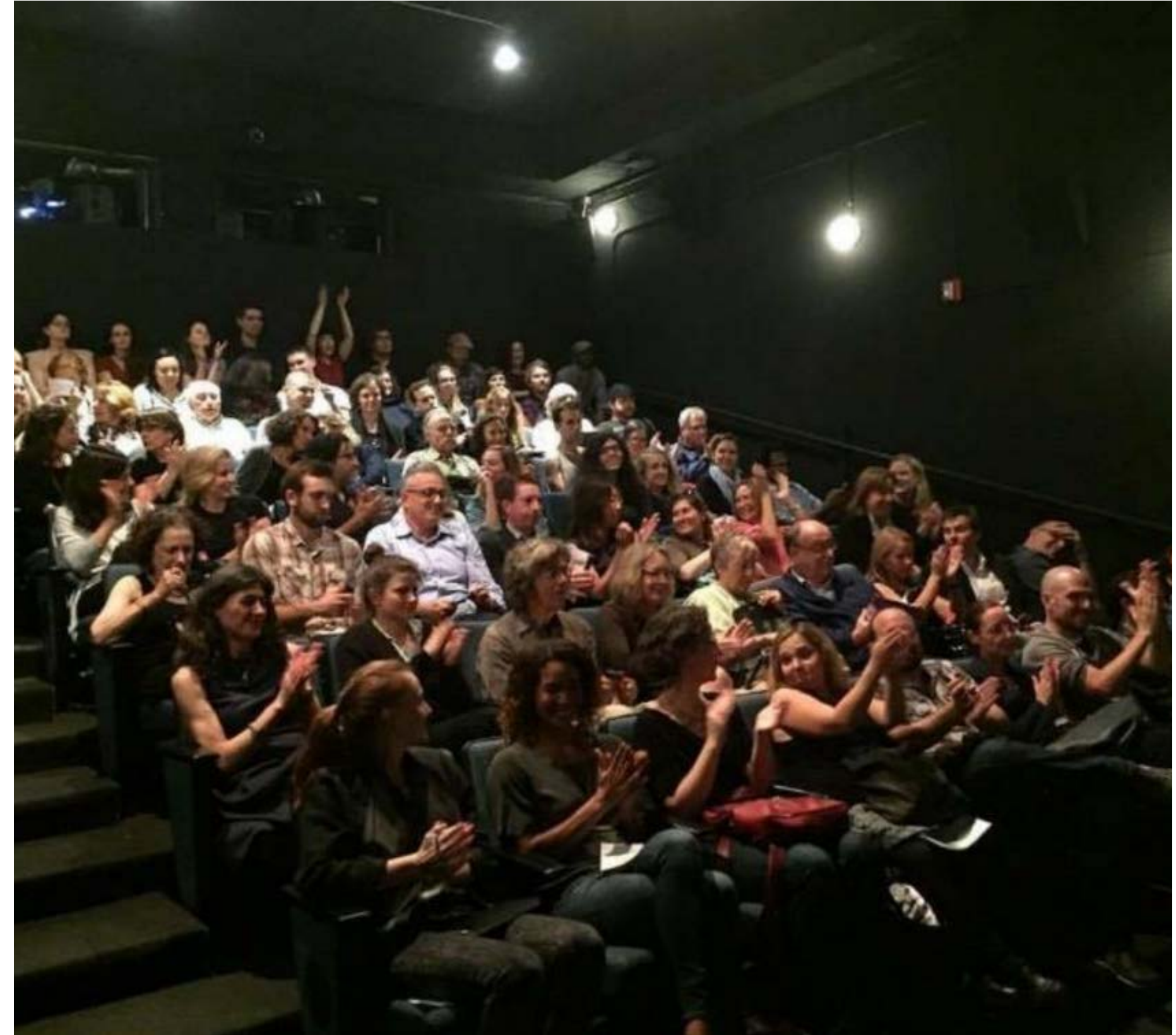
SEE MEMORY Audience at the Anthology Film Archives, New York City