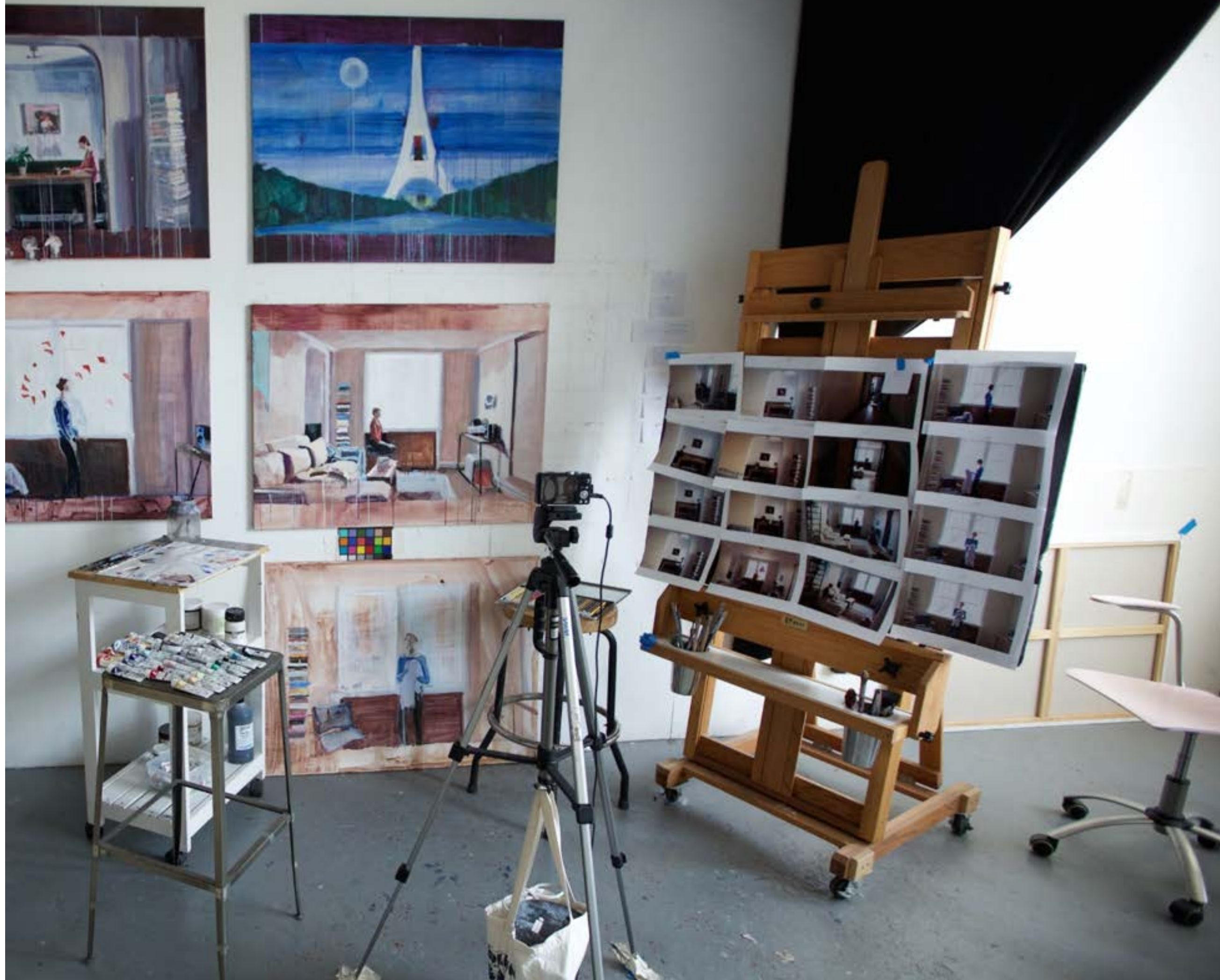
Inside the studio.