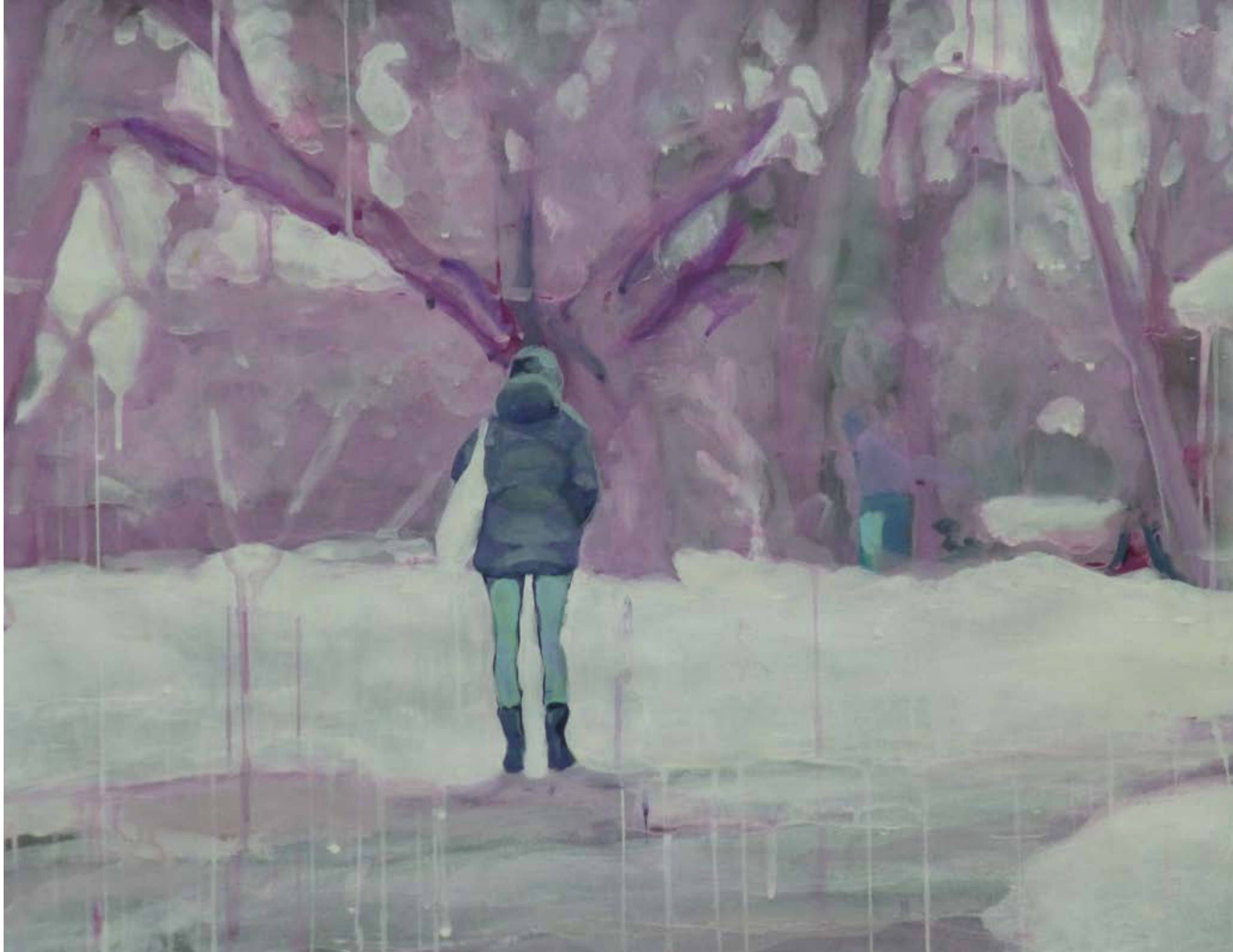
On My Way