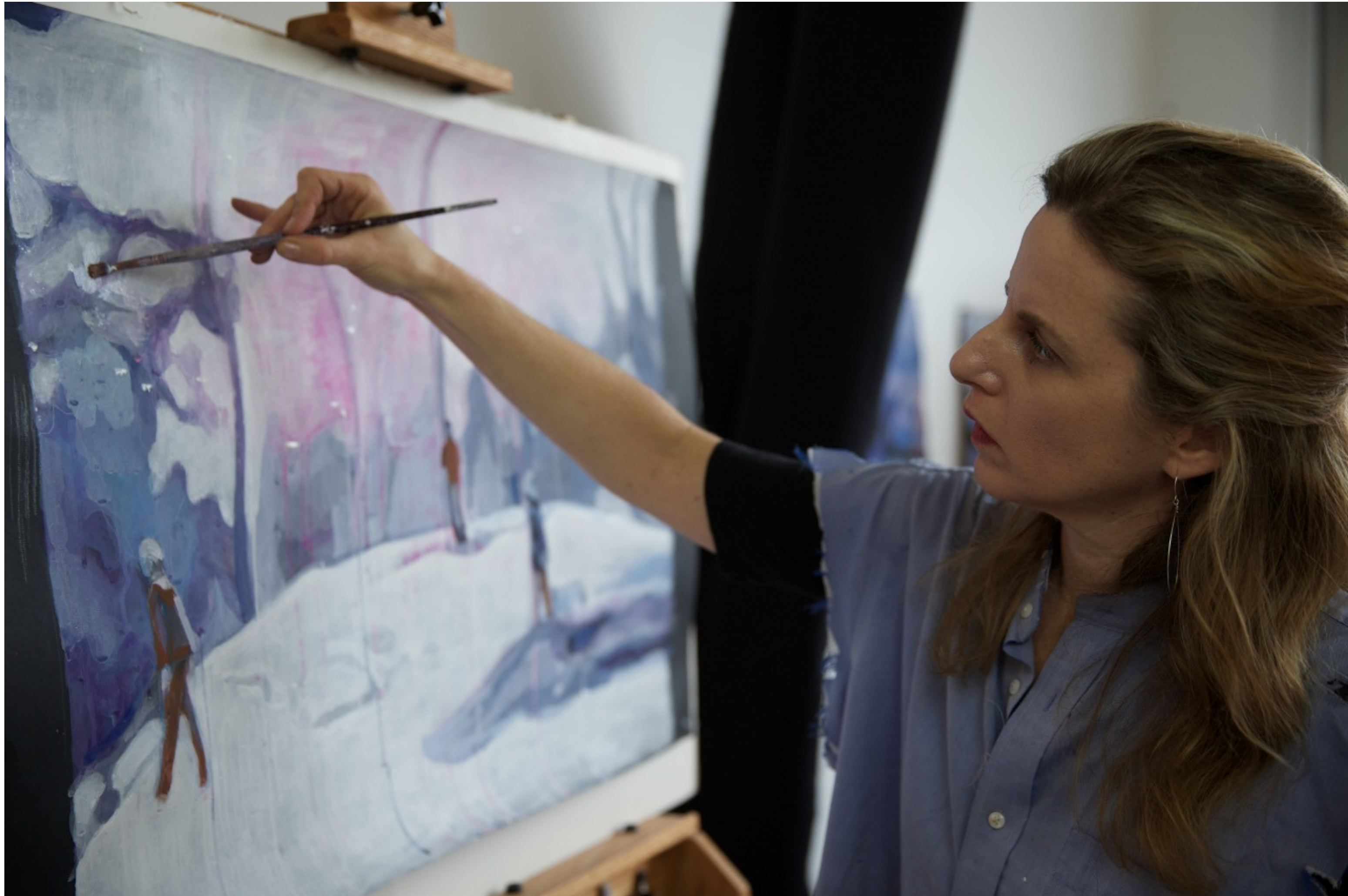
Painting SEE MEMORY