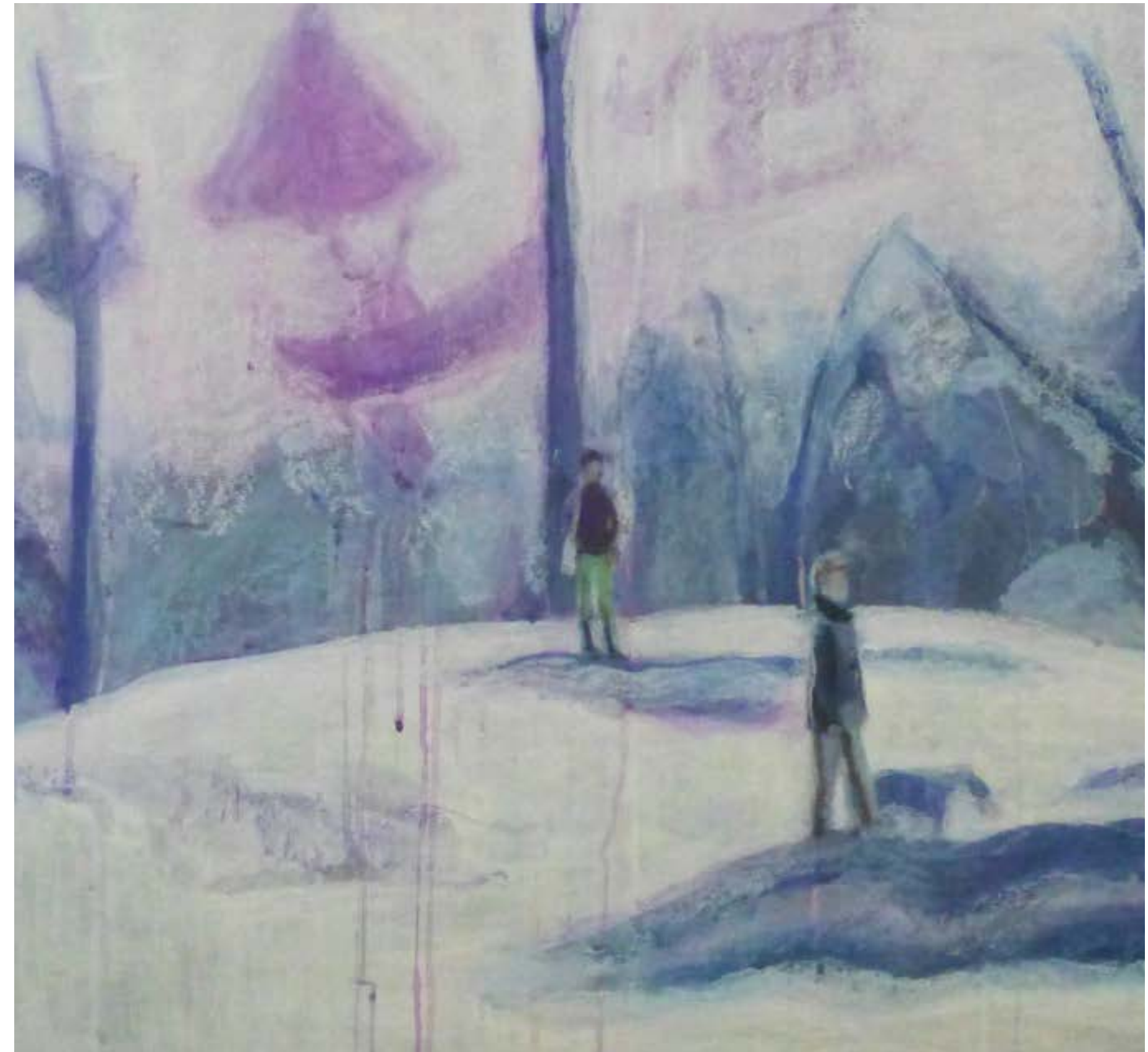
Girl on a Rock, SEE MEMORY