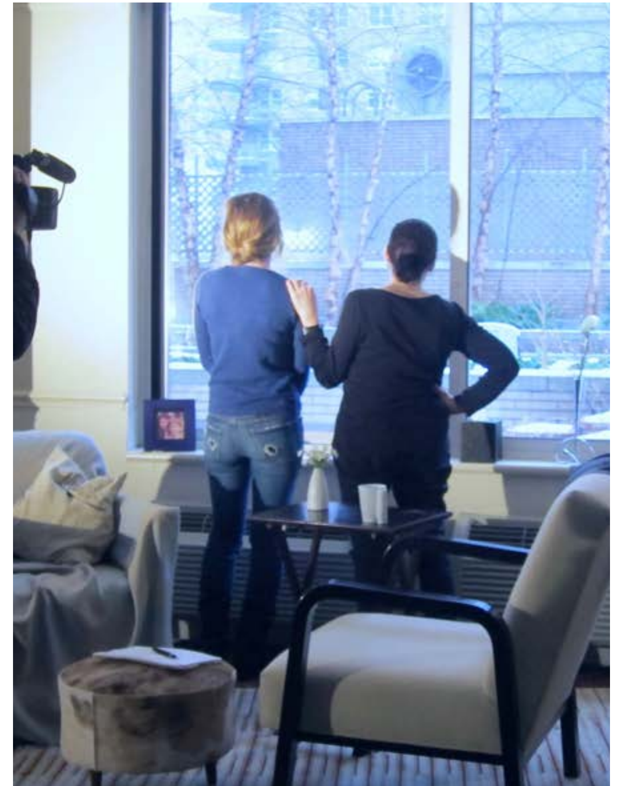
SEE MEMORY Set