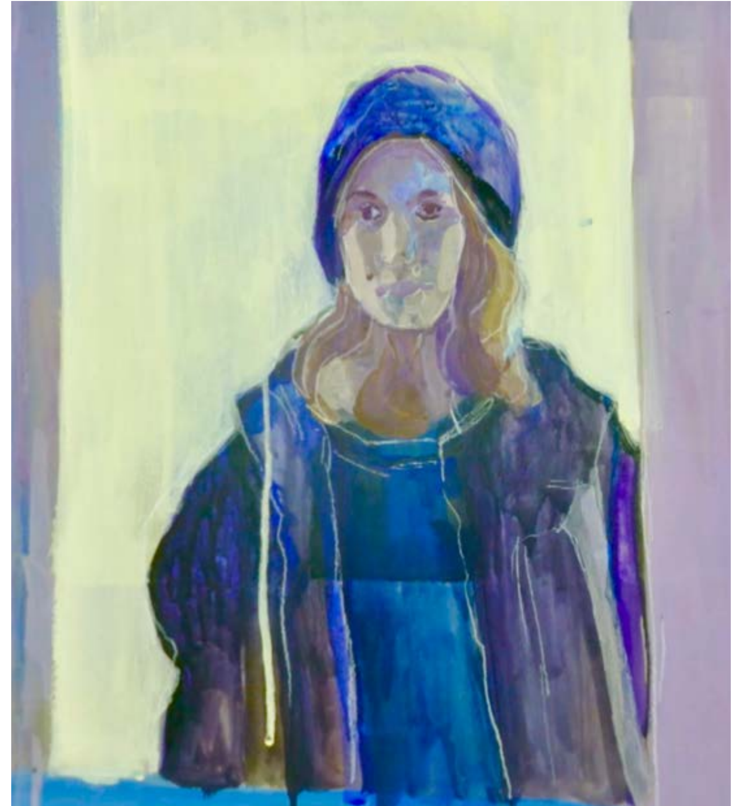
SEE MEMORY still