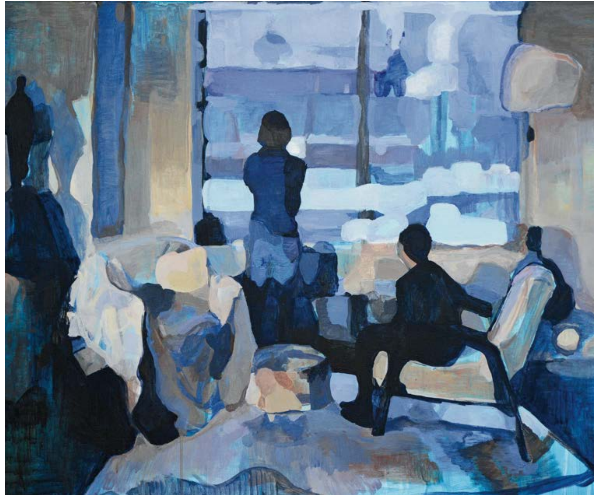
Painting: Reflection , SEE MEMORY