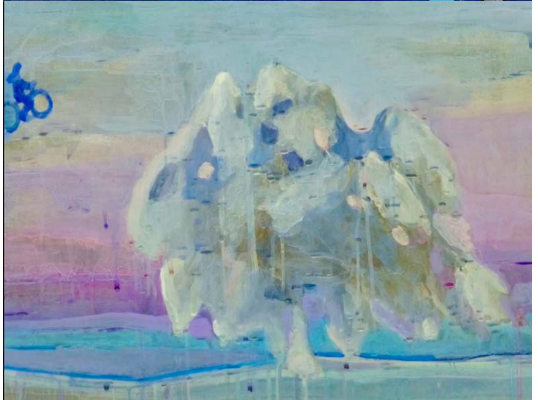
film still SEE MEMORY

Neuroscientist, Nobel Laureate Eric Kandel