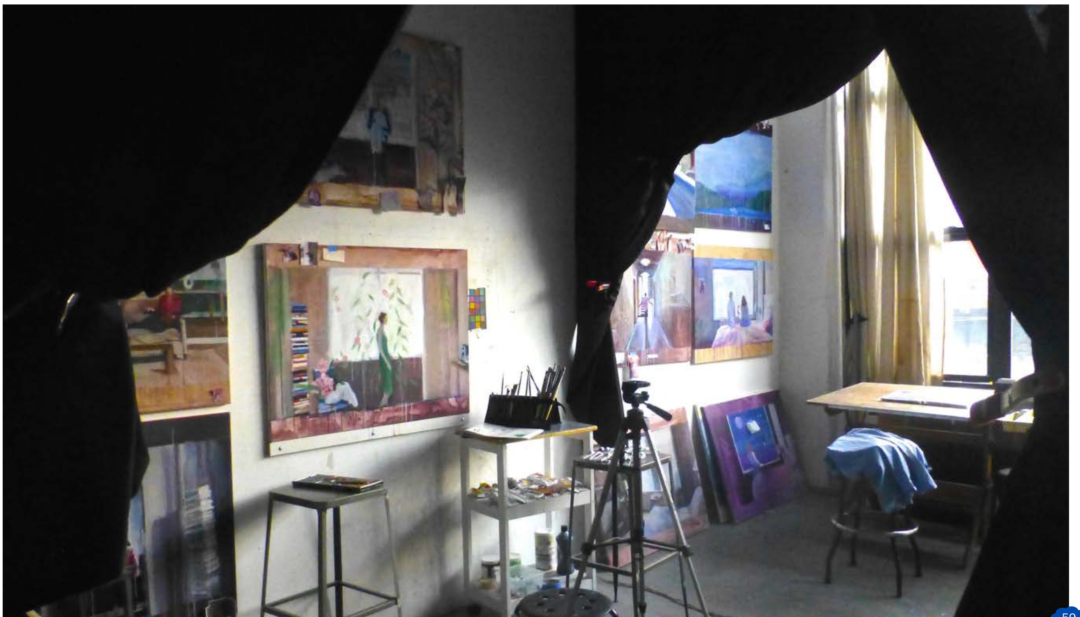
Inside the studio