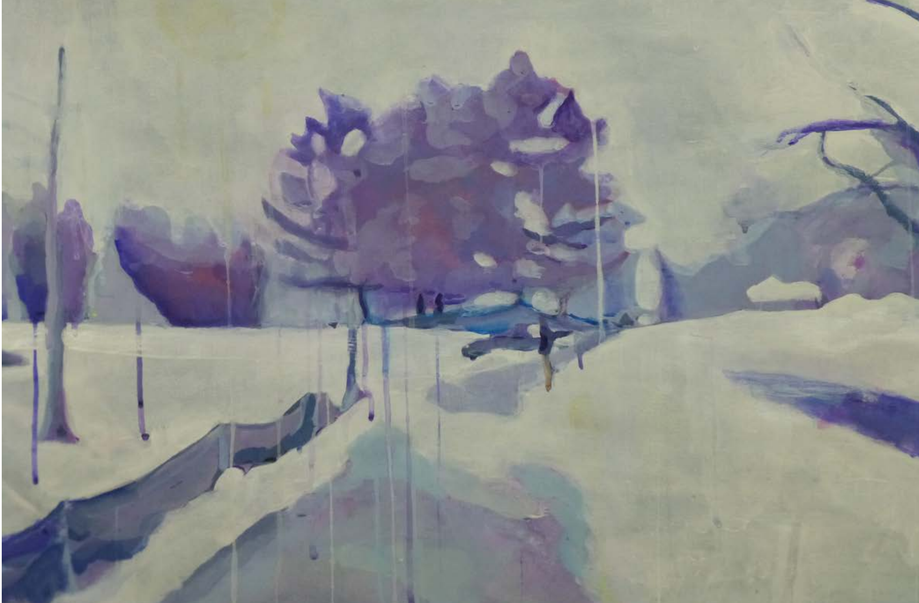
Purple Tree and Sun