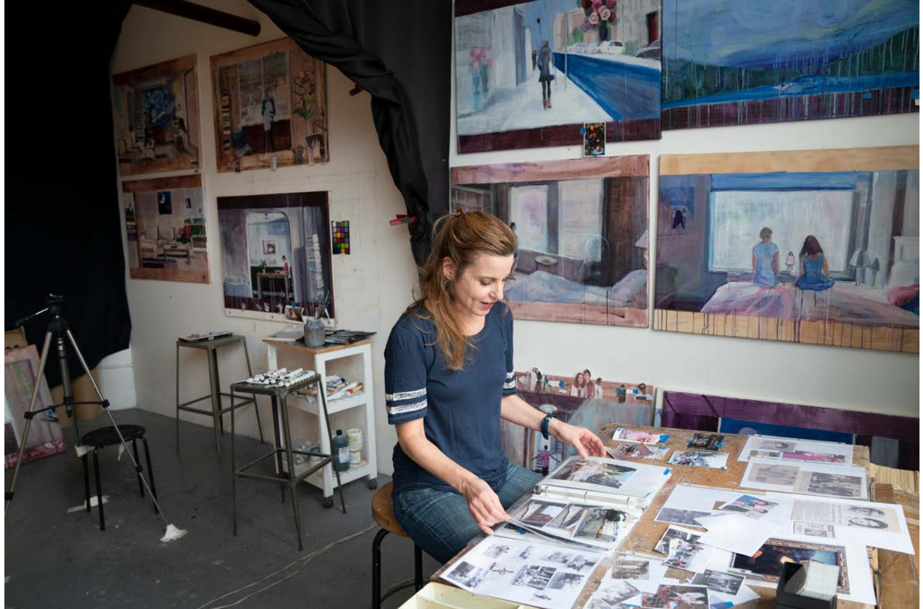
Inside the studio.