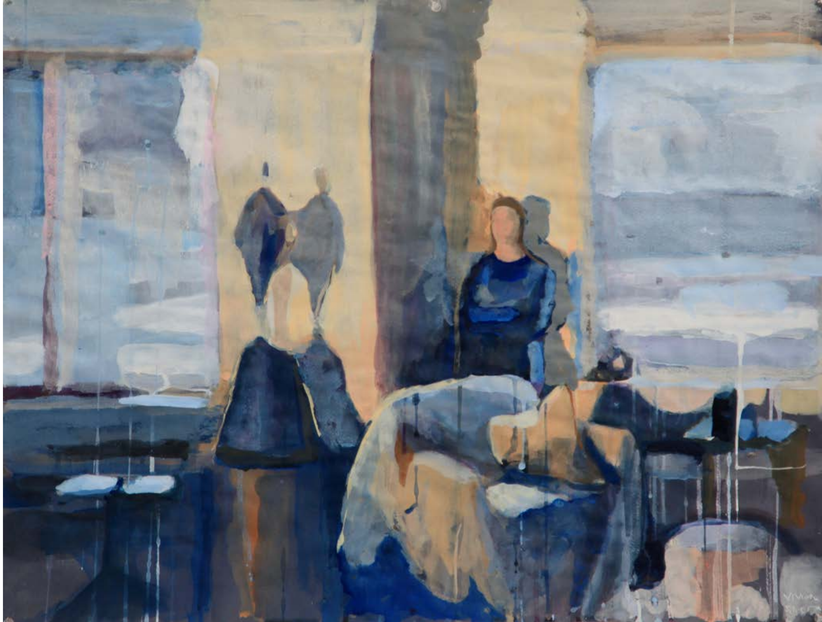
Against The Wall