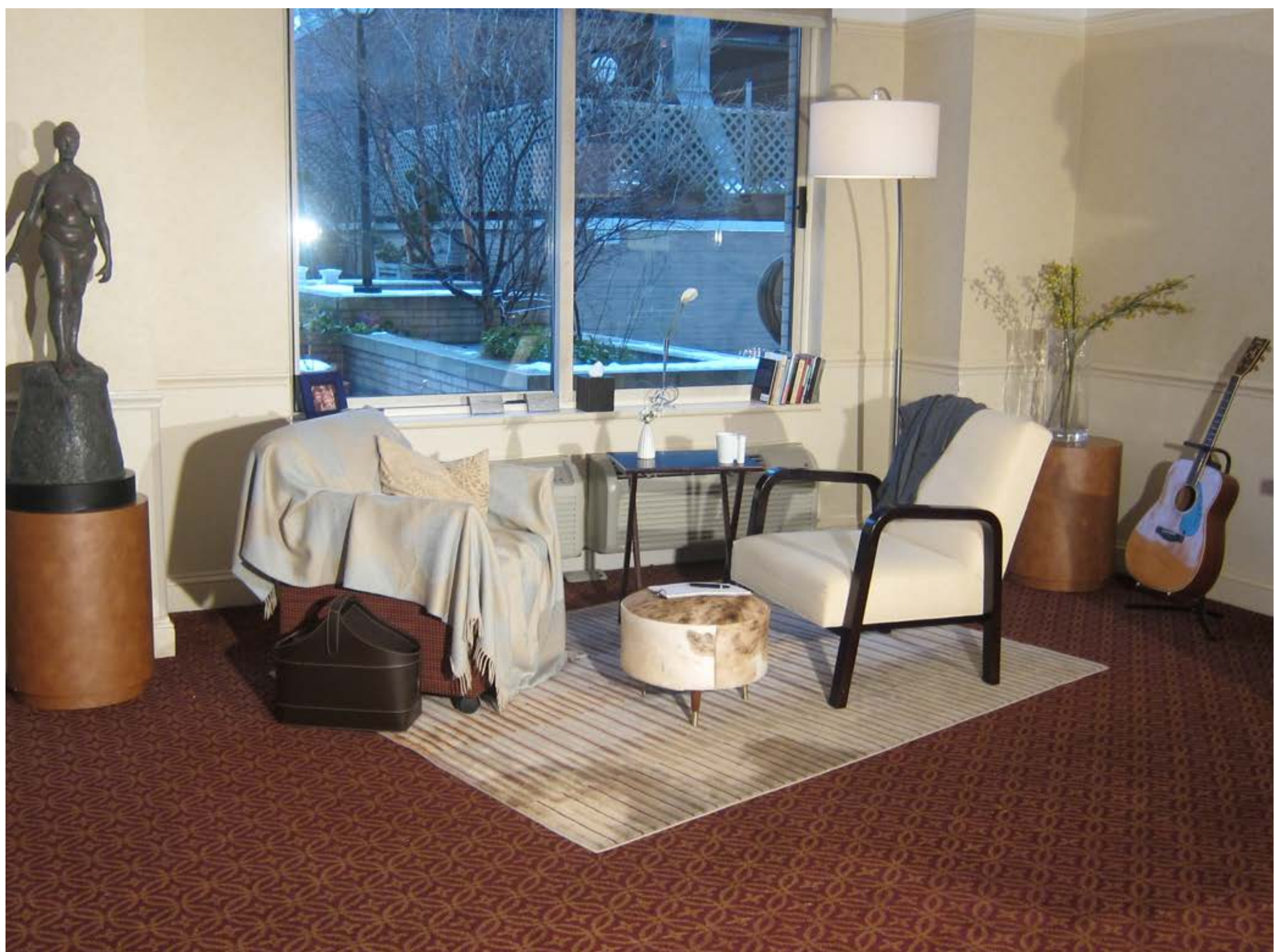
SEE MEMORY Set