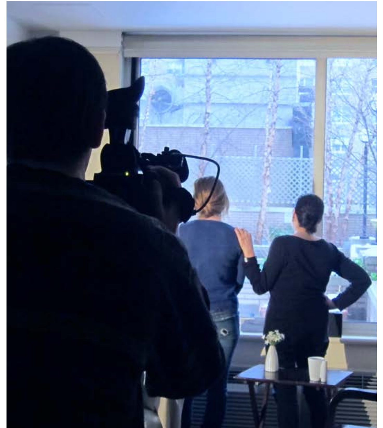
SEE MEMORY Set