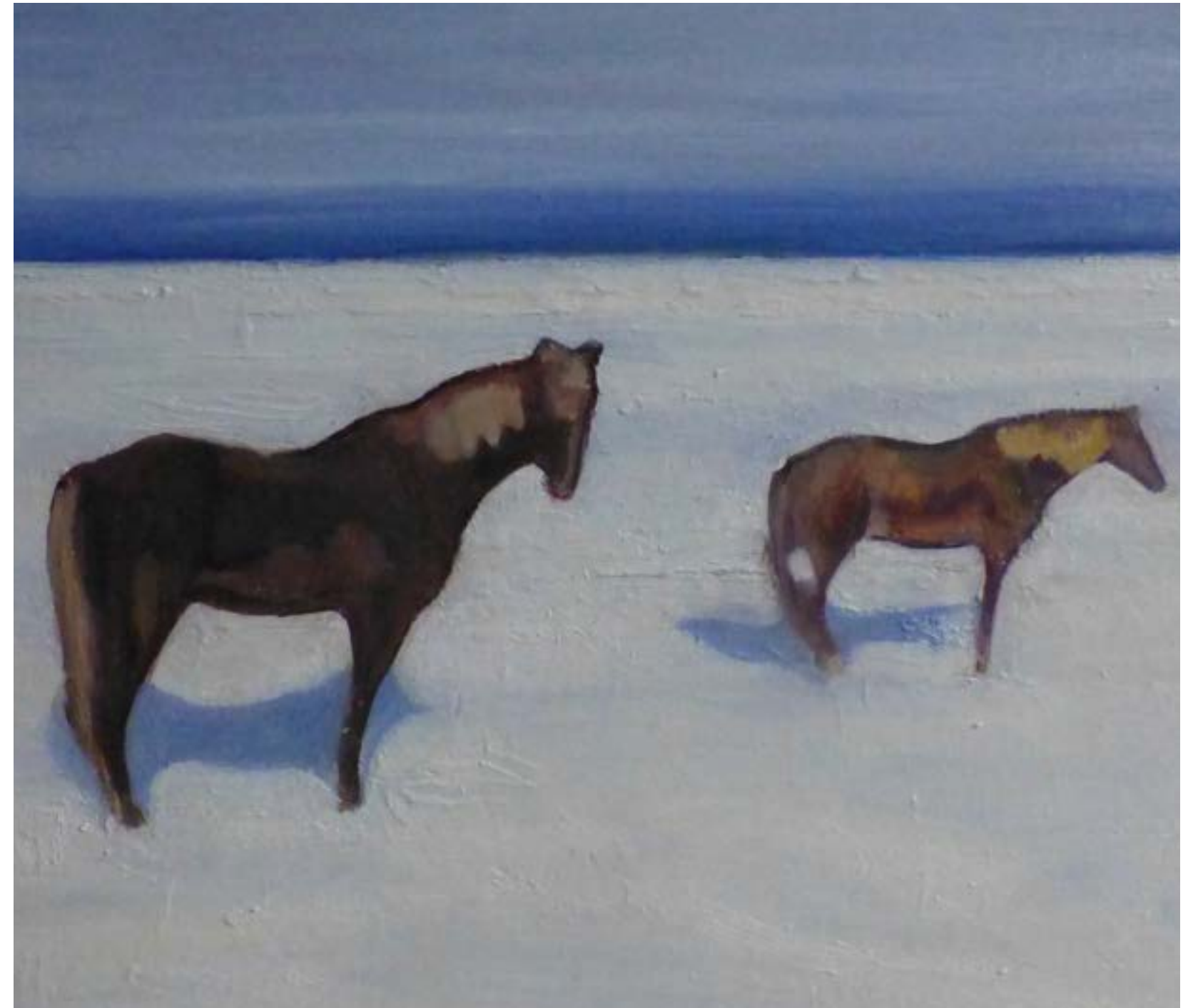
SEE MEMORY Still