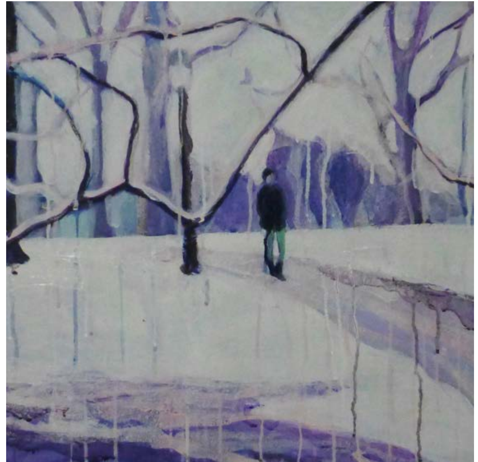
SEE MEMORY still

You know, I looked at your film earlier, and I got moved by her going through that window- there's a memory that got triggered there but I don't know what it is, I could feel it, I could feel that that image triggered something that moved me but I don't know what it is, I could just associate now and see what comes up as images, and one of the ways I add implicit memory is to quickly generate images in the moment, right now, and there could be flashes and maybe all the senses, there could be smells, there could be taste, and it could be visual memories that you just have, you just see the moment but you don't remember the scene, so that's when the other is body sensations, going into the body, trying to understand what is the memory associated with, the feeling, and that is very interesting when it comes to trauma, because traumatic memories, one of the understandings of why people have post-traumatic stress is that "they don't know that its over. Post-traumatic stress happens when the body and the brain still believe that it's happening right now, even though people consciously know that its not; the war is over and yet when they hear a siren outside they dive under the table, because the brain hasn't laid down yet that that experience is in the past. So that's where I see the body remembering more than the mind remembering."