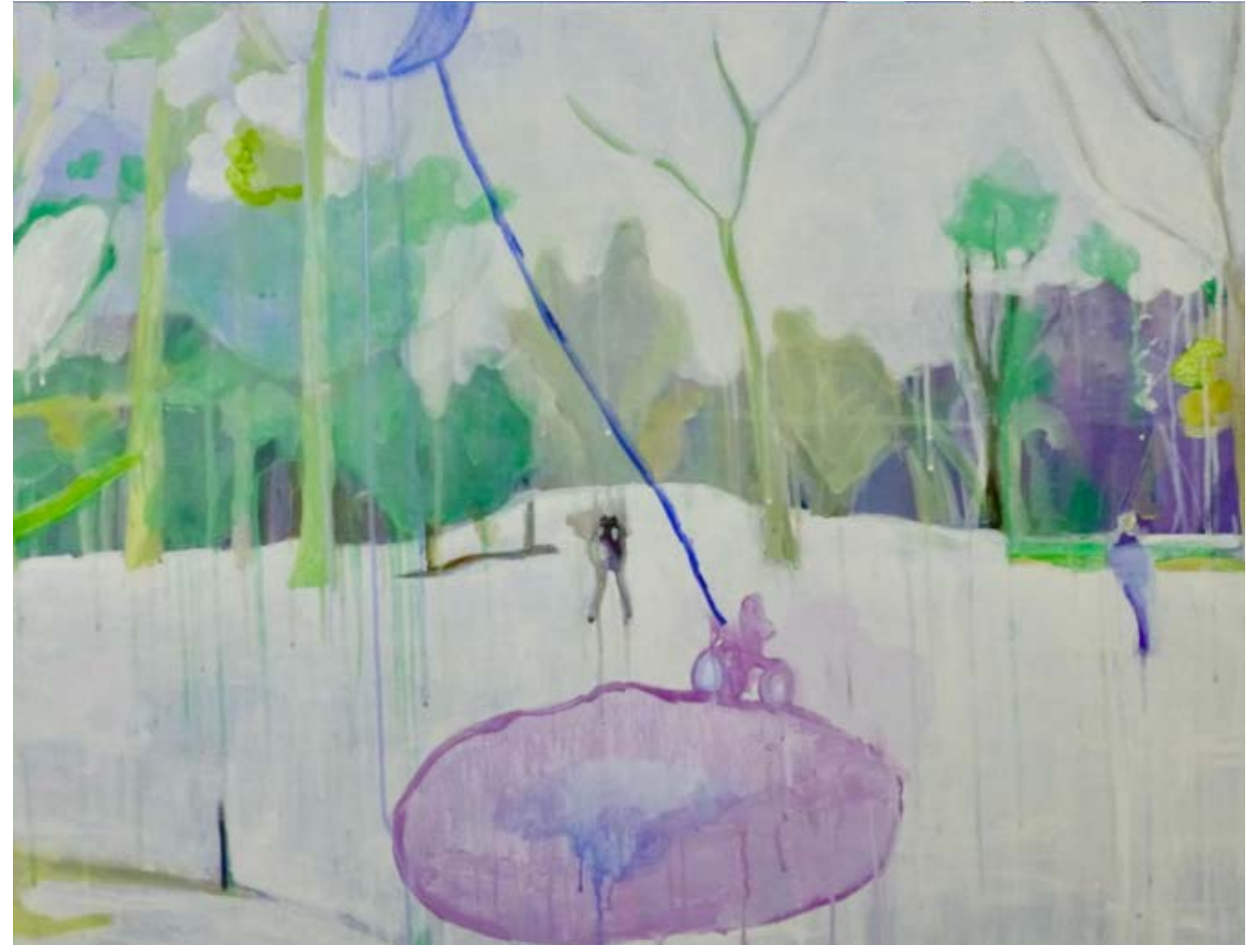
Moon on a String SEE MEMORY

VIVIANE: So the dream itself doesn't release anxiety. It's the after the fact.