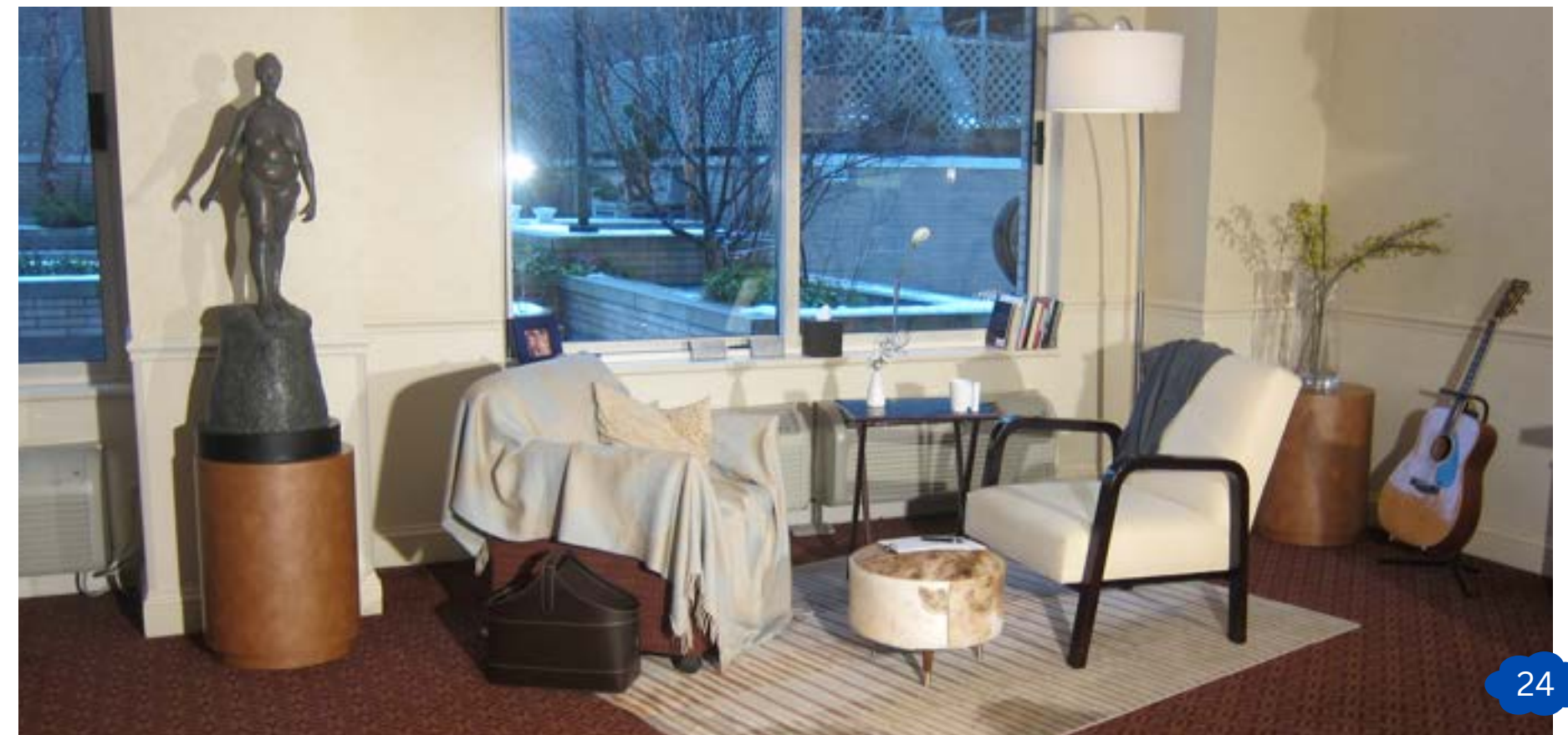
Top image: painting, The Empty Room, bottom image: photo still from footage